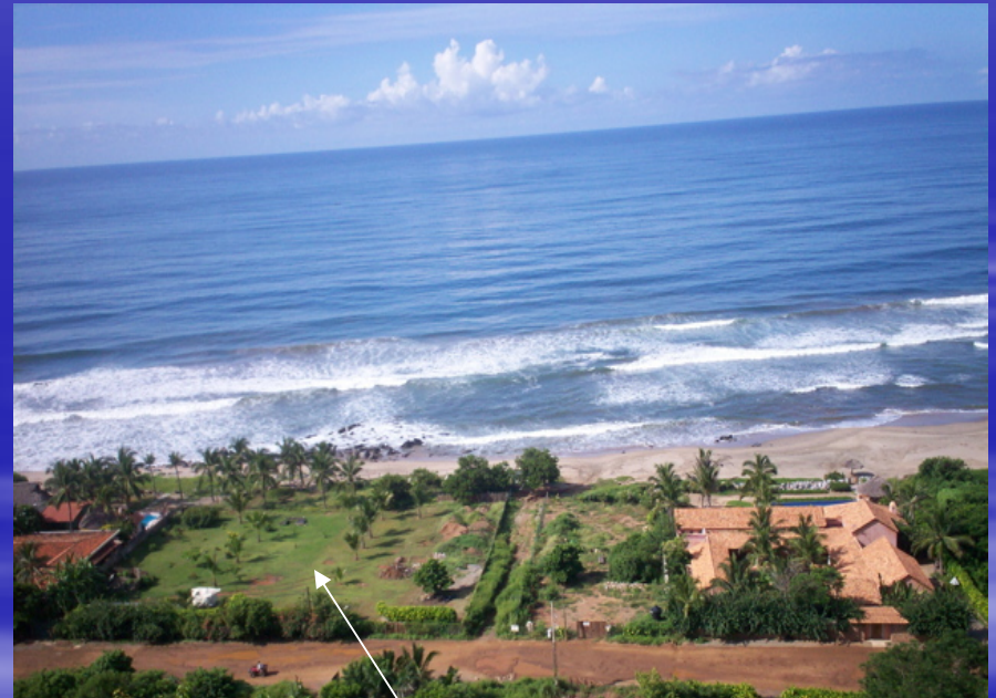
Residence building site from East hillside shown in picture to the left, looking West