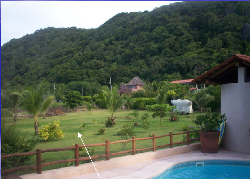
Eco-residence Buildings 1 & 2 site looking North from the existing B&B