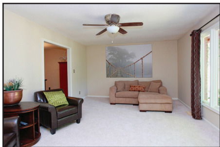
Formal Dining and Living Rooms are Great for Entertaining Family & Friends