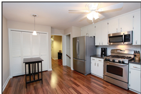
Updated Kitchen with SS Appliances and Gas Cooking

+Receive up to $500.00 when you buy this home with a Daymark Realty agent. Call to learn more about the Daymark Advantage program.