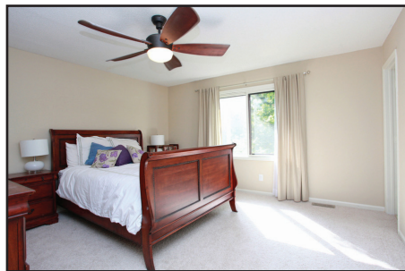
Spacious Bedrooms, including Master Suite