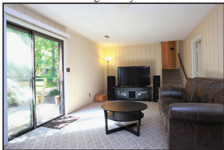
Large Lower Level Family Room with Access to Updated Deck