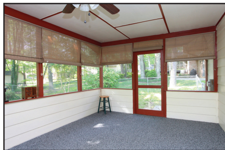
Wonderful Screened Porch off Kitchen