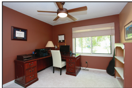
Flexible Fourth Bedroom of Office